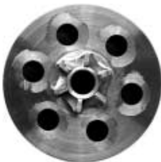
.22 Long Rifle