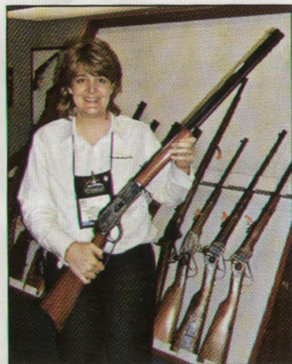
A long time coming, Uberti has finally introduced the large frame Winchester Model 1876 Centennial rifle.

competition ready right out of the box, it boasts a wide front sight, a real wide rear sight, slim, almost non-tapered checkered grips, improved springs, and then the guns are tuned so they are ready to go out of the box.