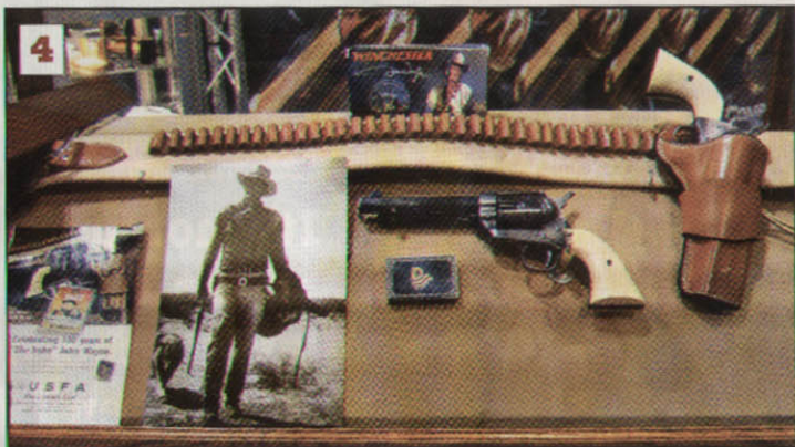
1) EMF will be selling the complete line of Pedersoli Colt Lightning slide action rifles in 2007. 2) The standard and deluxe Pedersoli Lightning rifles. 3) Charles Daly's new Rio Bravo M1892 large loop lever gun commemorates the Duke's 100th birthday. 4) The centerpiece of the USFA display is their John Wayne Red River limited edition gun, holster and gun belt.

Wayne's signature. The Custom Grade also comes with a fitted leather luggage case. They are priced at $1,999 and $3,499, respectively.